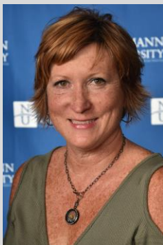
Professor of Education, Neumann University